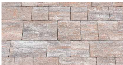
DSQ - 6 M