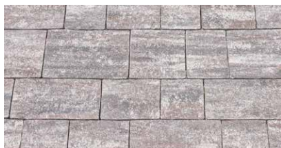
DSQ - 6 M